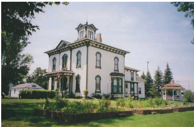
The Dunnell House

Owned and operated by The Steele County Historical Society